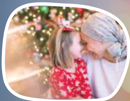
The Big Give Page 7