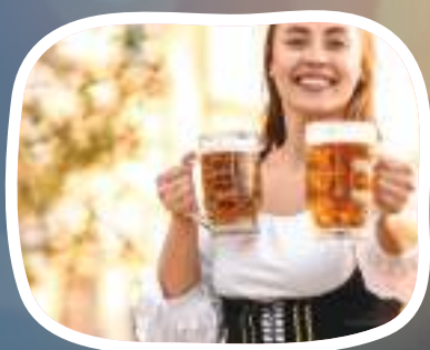
Oktoberfest Page 14