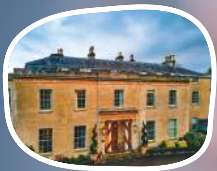
Christmas Raffle Page 4