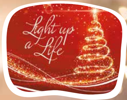
Light Up a Life Page 7