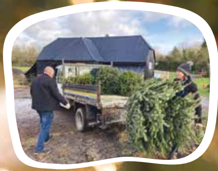
Christmas Tree Collection Page 13